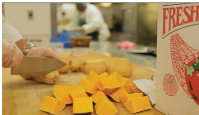
Common Market – Squash, USDA*

www.sustainableagriculture.net/publications/grassrootsguide/local-food-systems-rural-development/local-food-enterprise-loans/