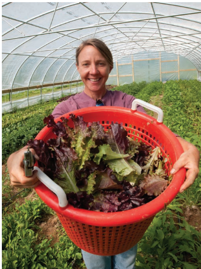
Fall Line Farms Cooperative; Richmond, VA

www.sustainableagriculture.net/publications/grassrootsguide/local-food-systems-rural-development/farmers-market-promotion-program/